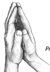
Praying hands flag